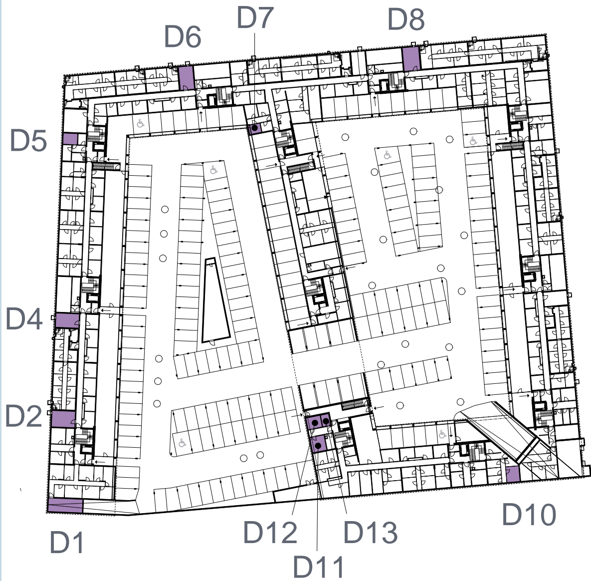
Disponibile Flächen im UG